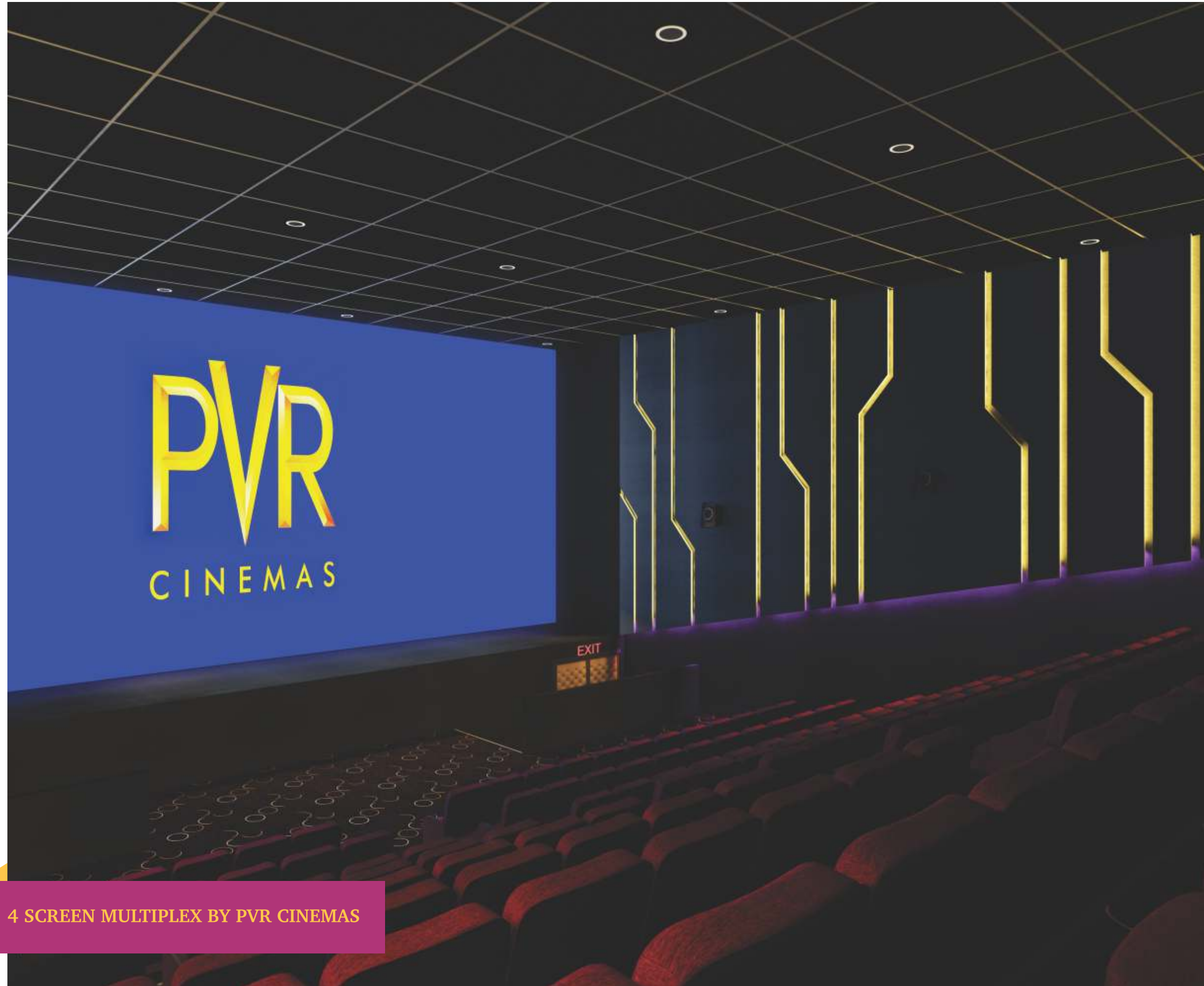
4 SCREEN MULTIPLEX BY PVR CINEMAS