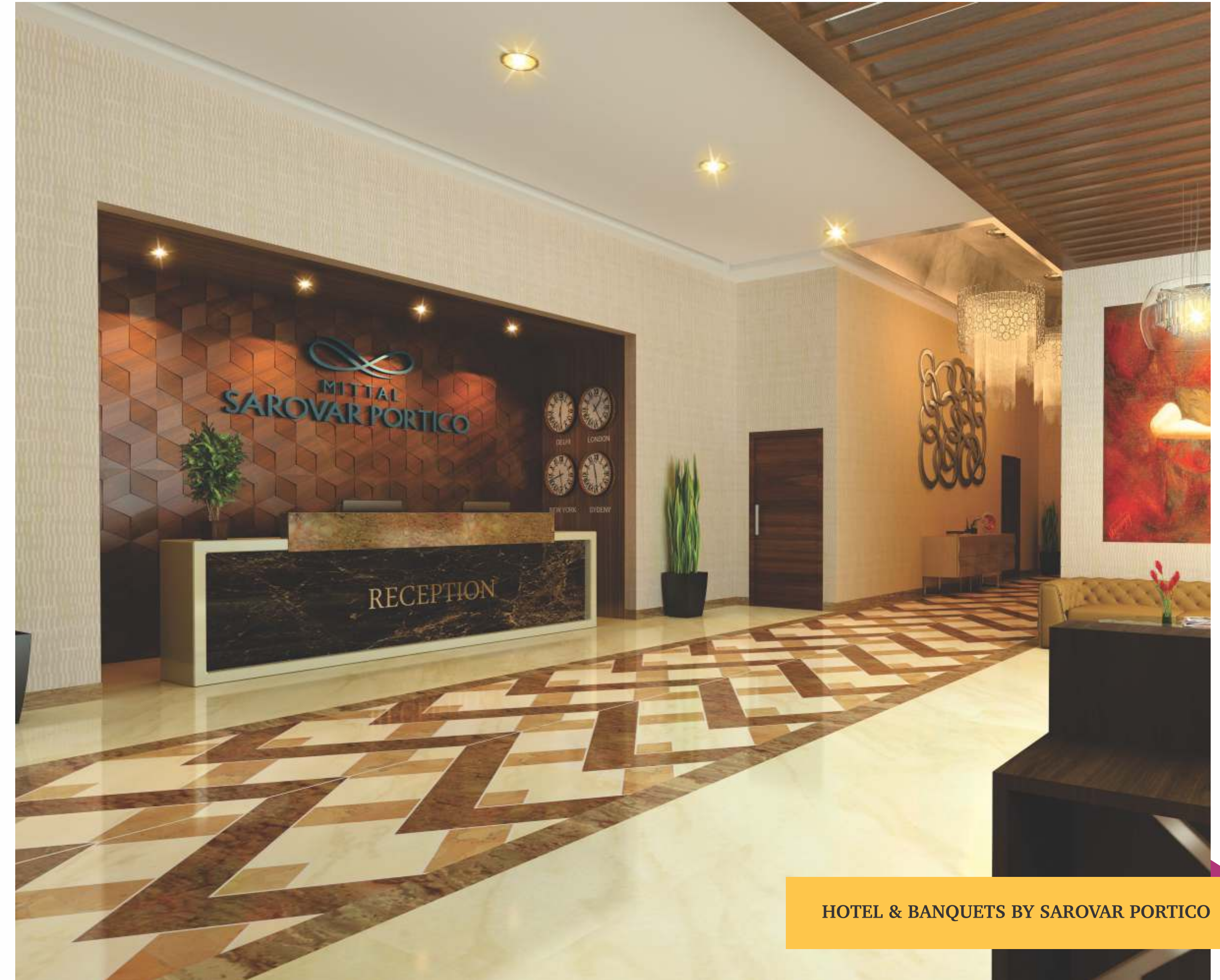
HOTEL & BANQUETS BY SAROVAR PORTICO

Top four floors of Mittal Mall are dedicated to Hotel Mittal Sarovar Portico by renowned Sarovar group. The hotel consists of 90 plush and well-managed rooms for luxury seekers. Hotel Mittal Sarovar Portico also has a luxurious pampering restaurant for that exclusive fine dining experience. To top up the whole affair with something mesmerising, Hotel Mittal Sarovar Portico offers a swimming pool on rooftop of the mall to relish a sunny day or a starry night delivering the best of the season.