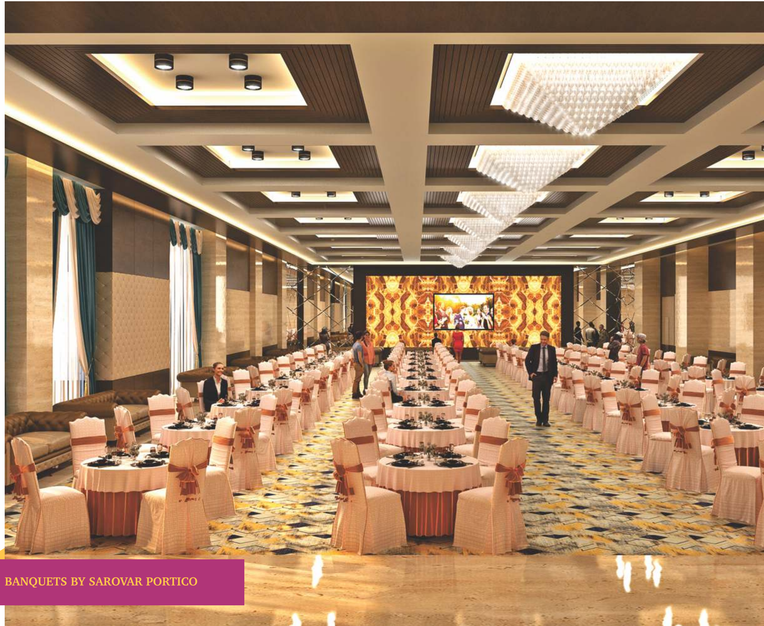
BANQUETS BY SAROVAR PORTICO