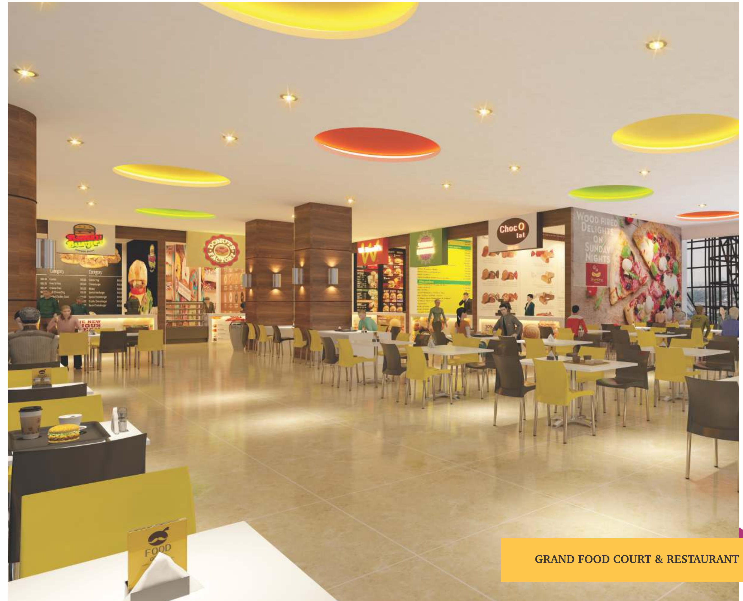
GRAND FOOD COURT & RESTAURANT

Food has a proper mention in Mittal Mall. A multi-cuisine grand food court and family restaurants house ample varieties of regional, national and continental food to all taste preferences. After joyous shopping or exciting movie show, grand food court at Mittal Mall perfectly compliments the experience of mall goers. So, whether it's about having something chilled or hot, spicy or soothing, tangy or sweet; menus here are a delight that caters to every palate and preference.